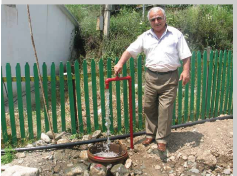
Water Main brings drinking water to every household in the village

"Meghri is considered the southern gate of Armenia, and is, undoubtedly, of great strategic importance for our country. In that sense, Armenia Fund's decision