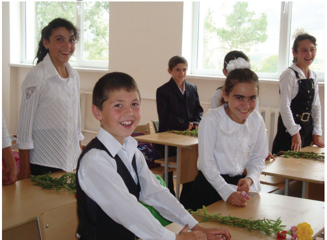
The local school brings the community together at Verin Horatagh

Verin Horatagh is a tiny community of 530 in Karabakh's Martakert region. Today, the local school has 100 students with another 70 at preschool age. The old building of the school, deeply scarred by time and war retains little resemblance to an educational center. Despite this, it still holds a very special place in the hearts of the people of Verin Horatagh as the first place to come back to life after the horror of the war was finally over.