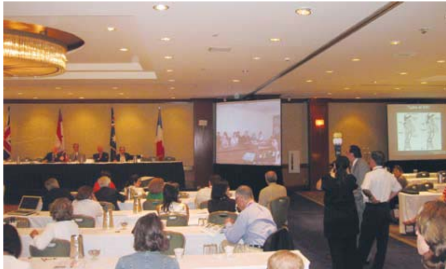
Armenia Fund's high quality video broadcast allows the panel of medical professionals in New York to collaborate with doctors at YSMU, Armenia, and contribute to the consultation of seriously ill patients.