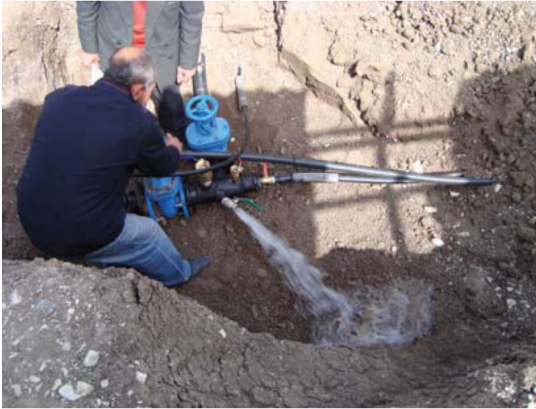
The new water-supply system brings fresh, clean water to residents of Berdashen.

Armenia Fund has completed the construction of a water-supply system in Berdashen, a village in Nagorno Karabakh's Martuni region. Comprising 16 kilometers of both gravitational and pressurized water mains as well as an inner network, the new system has already begun supplying the 1,582 residents of Berdashen with fresh, healthful water, derived from a number of mountain springs.