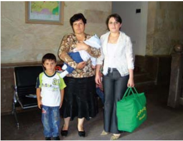
Armenia Fund distributes infant packages to socially and economically vulnerable families in Tavush.

The Armenian ministries of Social Security and Health and various NGOs estimate that over 5,000 families in Armenia with children under age one live in conditions of extreme poverty. The Ororots, or “Cradle” Project, was initiated in May 2002 by Armenia Fund USA in order to aid rural Armenian families in the care of their newest members.