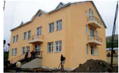
The children of Spitakashen will soon attend the newly built school in their community.