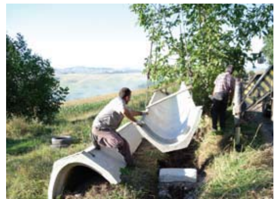
Armenia Fund's Agricultural Initiative targets many critical issues in rural Armenia, including the installation of improved irrigation systems.