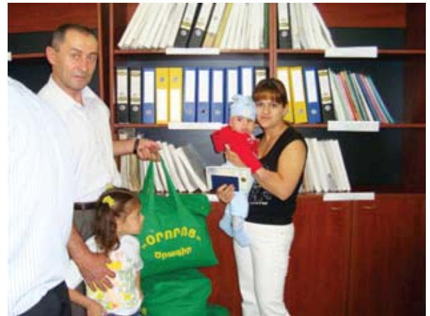
The distributed packages, intended for newborns up to age one, help relieve the daily burden of disadvantaged families.

Every Armenian infant’s first breath is a defining moment in our national destiny. Your support can ensure that Armenia’s neediest babies make it beyond the cradle and into a life of possibility.