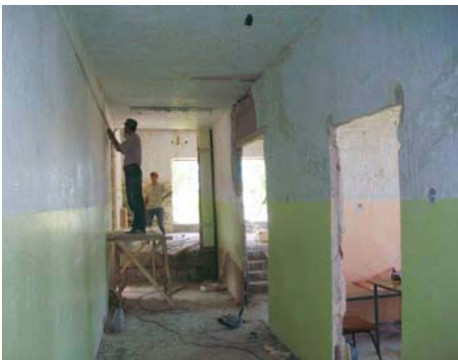
Major work is being done to rebuild the Noyemberyan Hospital in Tavush.

In July of this year, Armenia Fund launched a major development project to rebuild the Noyemberyan Hospital in Armenia's Tavush region. The initiative is cosponsored by the Fund's German, Australian, Swiss, and Lebanese affiliates. Additional support, in the form of