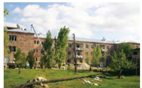
The first phase of the reconstruction project is well underway.

"The reconstruction of the Noyemberyan Hospital is an important step toward that goal."