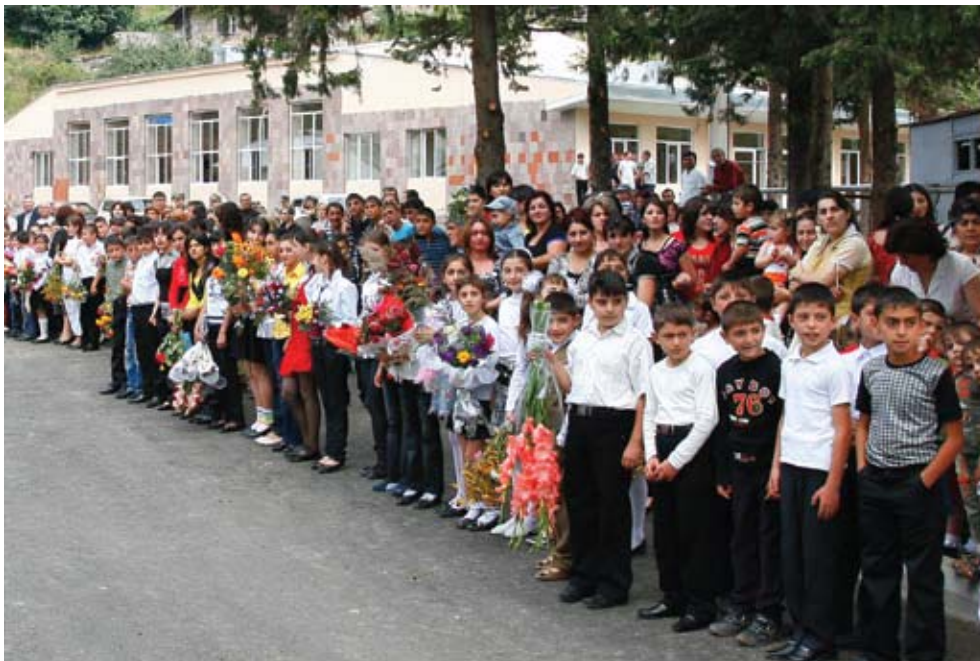
Students, teachers, and community members celebrate the opening of newly rebuilt school.

On a beautiful September day, Khashtarak, a village in Armenia's Tavush region, celebrated the opening of its newly rebuilt school with a jubilant ceremony attended by hundreds of community members as well as government officials, spiritual leaders, and Armenia Fund benefactors and representatives, many of whom had traveled to Armenia to participate in the event.