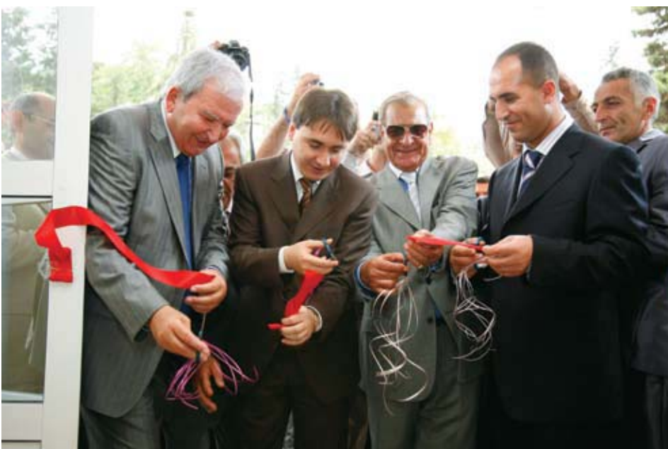
Armenia Fund benefactors and representatives participate in school opening ceremony.

Khashtarak is the site of a number of significant development projects implemented by Armenia Fund. Earlier this year, the Fund built a gas pipeline, providing 122 families with access to natural gas, and rebuilt the community clinic. Presently, the Fund is rebuilding the Khashtarak-Lusahovit-Ditavan irrigation network. When completed next year, the new system will secure the irrigation of about 600 hectares of land, greatly boosting local agriculture.