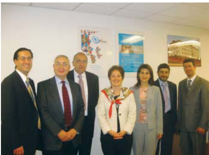
Ambassador Yovanovitch with the members of the Armenia Fund USA Board and staff, as well as young professionals and volunteers at the New York office.

As part of a series of meetings in four major Armenian-American communities in Greater Boston, New York, Washington, DC, and Southern California, U.S. Ambassador to Armenia Marie Yovanovitch visited the offices of Armenia Fund USA in New York on June 22, 2009. Ambassador Yovanovitch met with the members of the Armenia Fund USA Board and staff, as well as young professionals and volunteers.