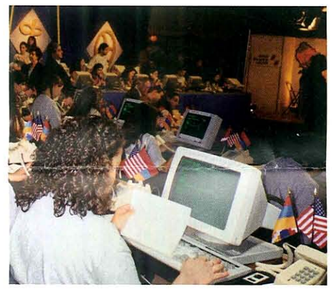
Telethon — Thanksgiving Day, 1999

With internal travel nearly impossible as a result of the Azeri policy to isolate the Armenian communities, the North-South Highway when completed, will connect with the now completed 70 km. East-West Goris to Stepanakert Humanitarian Highway—another AFUSA project facilitating travel between Armenia and Karabagh.