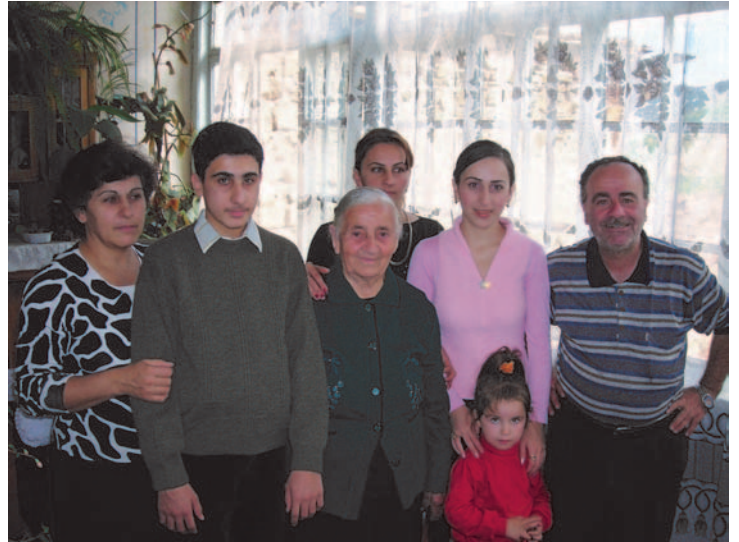
Four generations of a family in Ughtadzor Village, Nagorno-Karabakh. The younger daughter (second from right) recently married and left for better prospects in Yerevan. This family, like many others in rural Karabakh, produce their own food, including wheat for bread. They are now benefiting from Armenia Fund's Agricultural Initiative in Karabakh.

“While I am and have been involved with other humanitarian and development organizations in the community, I have always admired the work of Armenia Fund because of its focus on rebuilding the infrastructure of Armenia and Karabakh, which is critical to their development, in addition to its other projects directed to providing assistance to the poorest regions of Armenia. Also, another important factor is that the Fund unites the entire Armenian Diaspora. It is inclusive in its mission and bridges the gap to further its vision of a prosperous Armenia which all of us share.