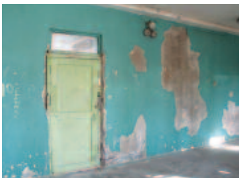
School Before: A classroom in a dilapidated condition a school in Gyumri, 1993

Active for only two years, Armenia Fund became an important part of Armenian reality from 1993-1994. The Fund stood closely to the people at a time of trial, adjusting its mission to the needs of a fledgling nation.