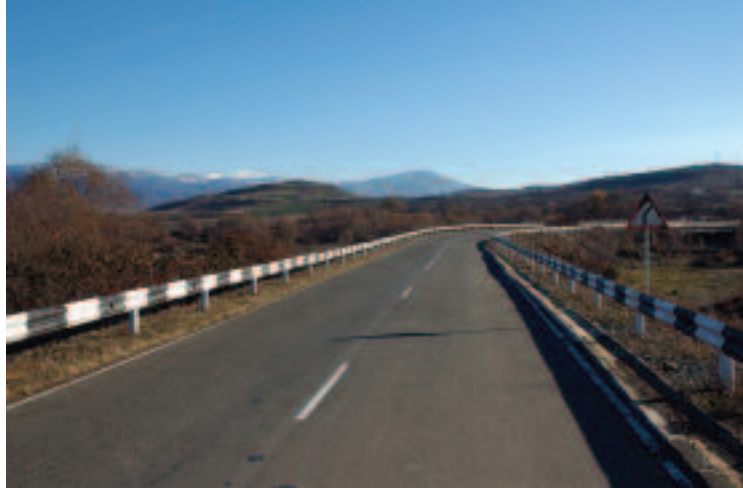
North-South Highway — the "Backbone of Karabakh"

connecting 150 towns and villages throughout Artsakh, took the name "backbone of Karabakh" and became a landmark undertaking. Embodying the united efforts of the Diaspora, the road symbolized economic revival and security.