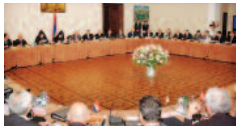
Armenia Fund's affiliates adopted the Rural Development Program to extend its comprehensive infrastructure and economic program to Armenia's villages