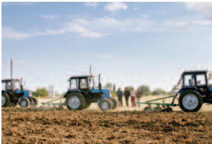
Agricultural Development Associations are established in the Mardakert and Hadrut regions of Karabakh

"Build a New Horizon" dubbed Armenia Fund's 2005 International Thanksgiving Telethon. It was, however, more than just a slogan. The campaign was a call of confidence for new directions that the organization was taking to better address pressing needs of development in Armenia and Karabakh.