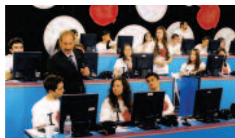
Renowned attorney Mark Geragos taking calls at the 2006 Telethon