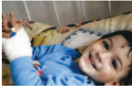
Children who were born with health problems are born again in this institution