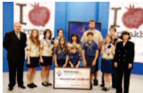
Armenian General Athletic Union & Scouts at the Telethon studios

Join us on Thanksgiving Day to set another record!