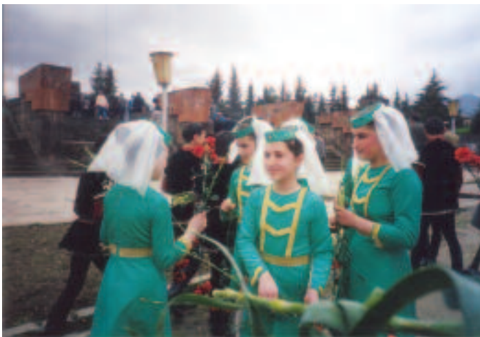
Children in traditional dance costumes at the opening of the Stepanakert Boarding School, 1997

Along with the several large-scale initiatives already underway in Armenia and Karabakh, from 1997-1998, there was an upsurge in