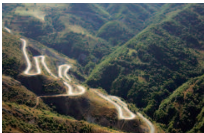
Goris-Stepanakert Highway — the "Life Road" of Artsakh connecting Karabakh to Armenia, 1996

By 1996, four years after its establishment, Armenia Fund's projects were already in full swing. These years were most significant as this was when the Fund's mission and objectives were expanded to include major strategic initiatives in a wide range of areas – large-scale infrastructure, social and economic well-being, public health, as