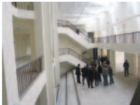
School After: The Gyumri school 2 years after Armenia Fund rebuilt the entire school complex