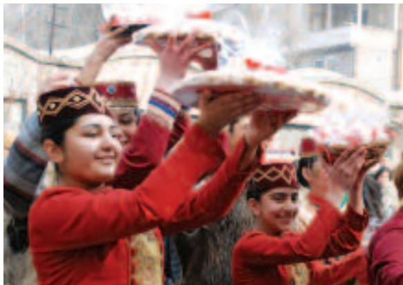
For 15 years, Armenia Fund has touched countless lives in Armenia and Karabakh.

and business and community leaders. The evening featured a keynote address by His Excellency Vartan Oskanian, Minister of Foreign