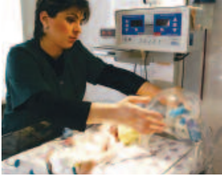
The Yerevan Children's Hospital provides the only intensive care unit for infants in the Republic

The Yerevan Children's Hospital, now renamed the University Clinical Hospital, has long been at the center of Armenia Fund's attention. Since 1997, the hospital's laboratory, surgical department and intensive care unit have been reconstructed. All three projects were funded by Argentinian-Armenian philanthropists.