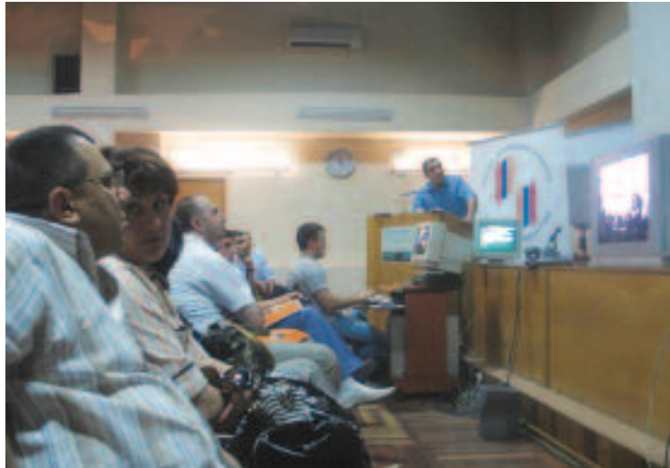
The Telemedicine Seminar connected the Stepanakert Polyclinic in Karabakh with the Arabkir Medical Center in Yerevan

Telemedicine links a physician with a patient in a remote area. The innovative medical technology makes it possible to ignore constraints of time and distance, and with the concurrent advancement of Internet and digital communication, it revolutionizes the way healthcare is delivered to underserved communities.